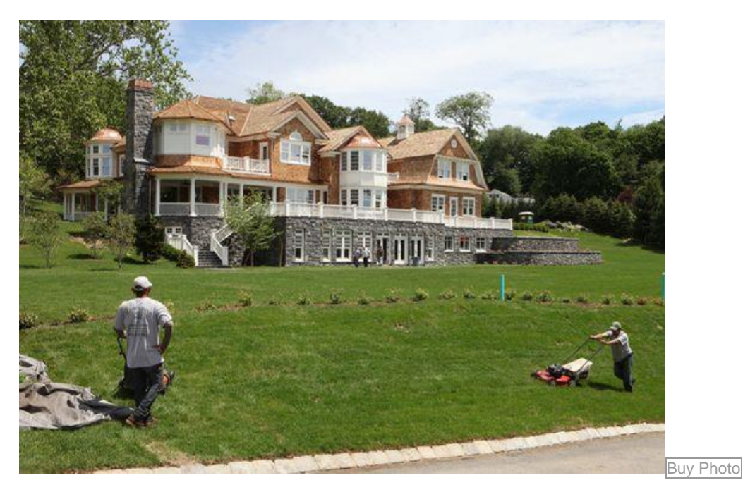
The first home in the new gated community of Greystone on Hudson came on the market this week, priced at $9,998,888.

Last week, a small army of landscapers was swarming over the site, mowing and weed-whacking the freshly laid sod to get everything ready for the opening party. There was a constant din from the steady stream of huge construction trucks rumbling up and down the roadway that winds through the new development.